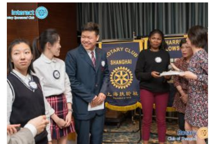
Getting ready for the pins