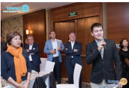
The Four Way Test